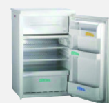
Fridge EUR 70.70 per pc.