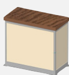
Degustation counter H = 1000 x 500 x 1050 mm EUR 87.40 per pc.